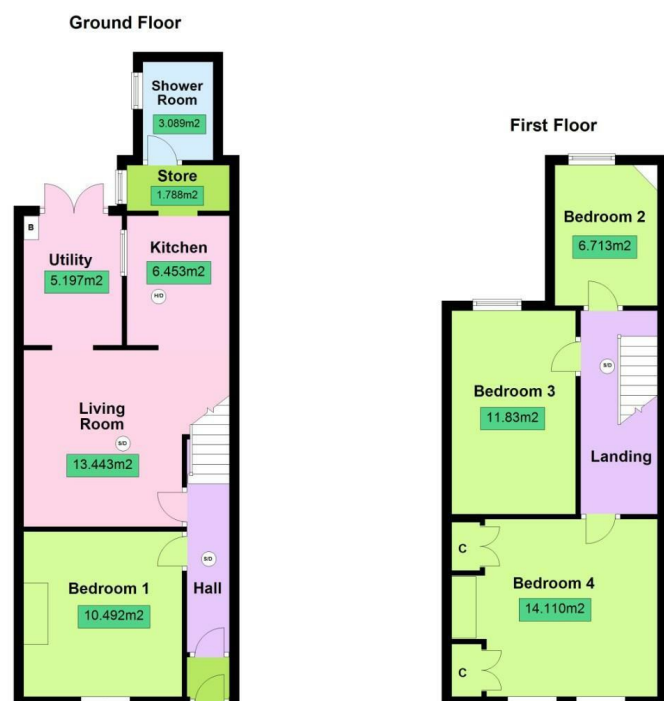
37 Burnham Road, Bath

VIEWING AND OFFER PROCEDURE: If you wish to view this property, please contact our office on the number provided. All offers on this property should be made through this office. In order to fulfill our responsibilities to the seller, when offering on this property, you will be asked a series of questions about how you intend to fund the purchase and whether or not your offer is dependent on the sale of another property. This information provided by you, along with the amount of your offer, will then be forwarded onto the seller for consideration.